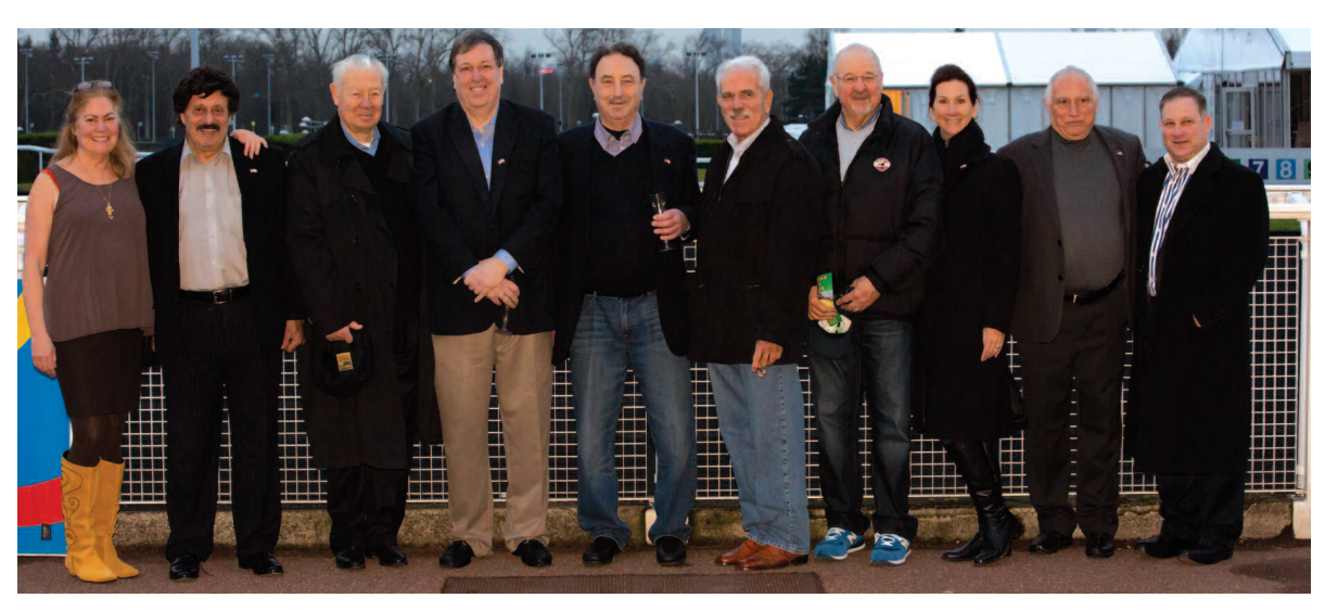
The US delegation at Vincennes Racecourse.