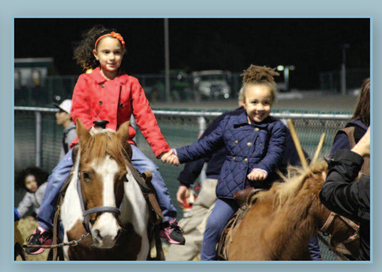
October 19, 2013 - Children enjoying pony rides at Fall Harvest Festival.