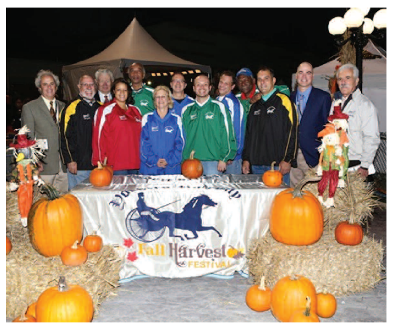
Fall Harvest Festival, October 19, 2013 Legislators that participated in Race.